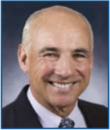
The Honourable James Farley