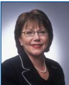
The Honourable Anne McLellan