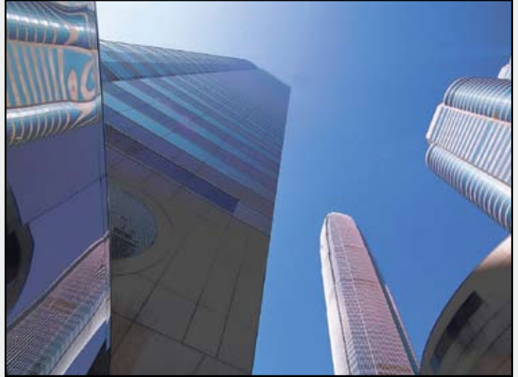
Exchange Square and the International Finance Centre in Hong Kong's financial district

Practice on Shareholders' Capital (Shin-nihon-hoki: 2006); UFJ vs. Sumitomo Trust vs. Mitsubishi Tokyo: Legal Risks in M&As (Nippon-hyoron-sha: 2005); Revised Commercial Code, Accounting and Tax (Shin-nihon-hoki: 2d ed., 2004); Practitioners' Guide: Law and Tax on Corporate Reorganizations (Seibunsha: 2002); Practitioners' Guide: Law and Tax on Corporate Divestitures and Mergers (Seibunsha: 2001); and Business Combinations, Corporate Governance and Corporate Finance (Shinzansha: 1999). He is an international affiliated scholar of the National Centre for Business Law.